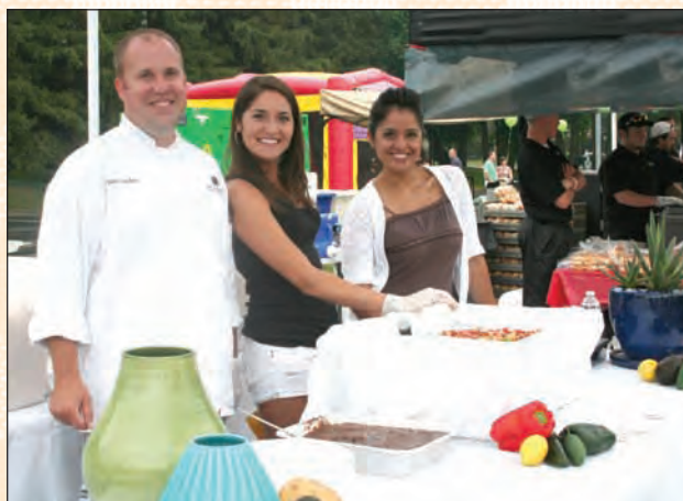
Freshly made guacamole, chips and salsa from Cantina Laredo were popular with the crowd, tying for first place in the Peoples Choice appetizer category.