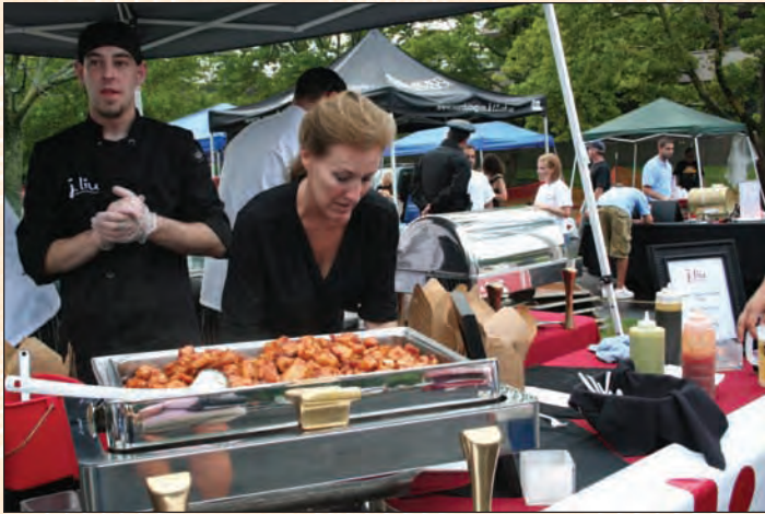
Above: Servers from J. Liu Restaurant & Bar ready chafing dishes of J. Liu's spicy chicken entrée. J. Liu tied for first place in the appetizer category with their lettuce wraps served in a whimsical Asian food take-out container. Right: Guests lined up for lamb chops and smoked turkey club sandwiches at Brookside Golf and Country Club's booth. Brookside tied for third place in the entrées category.